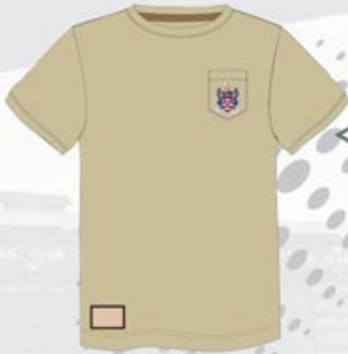
FH1204 Heritage Chest Pocket Tee