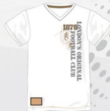
FH1207 Heritage V Tee