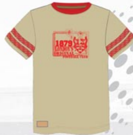
FH1205 Heritage Contrast Sleeve Stripe Tee