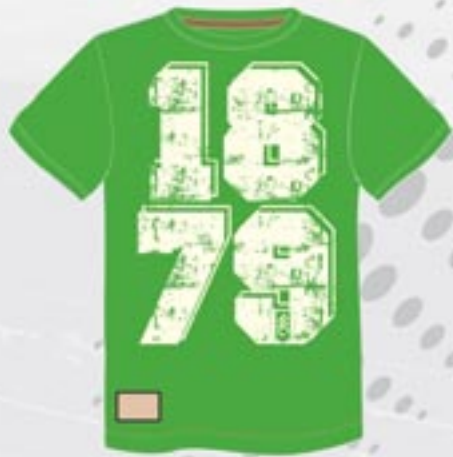
FH1206 Heritage 1879 Tee